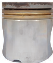
Power cylinder assembly

After 11,899 operating hours on Mobil Pegasus™ 605 Ultra 40 (35,519 total engine hours), critical components were removed and evaluated. Power cylinder assemblies showed minimal carbon deposits, varnish and lacquer in piston lands and grooves.