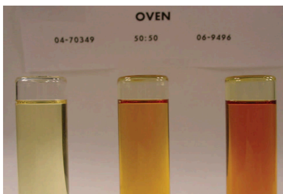
Example of Stability Testing Results at Varying Ratios

In addition, turbine oil performance tests may be conducted on the ratios of new oil and used oil that are expected to be encountered in the system. For example, if the reservoir is 5,000 gallons you expect to have 500 gallons of residual old oil in the system, the ratio at which to test is 90 percent new oil to 10 percent old oil. Typically Foam, Demulsibility, RPVOT and Ultra Centrifuge tests are evaluated. The results of these tests should be in line with the expected performance levels that would be obtained for a blend of the new oil and the used oil in the system.