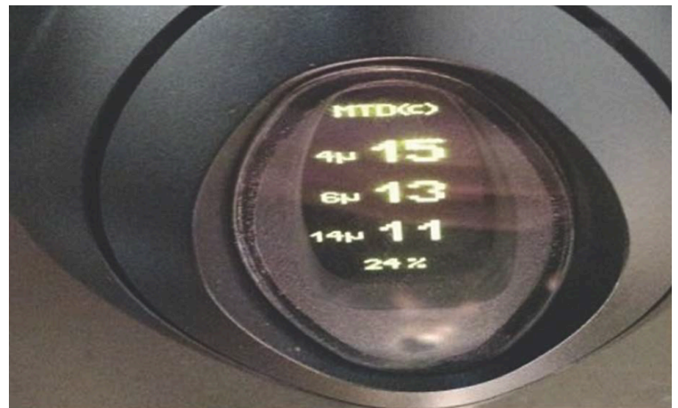
An inline laser particle counter provided real-time oil analysis

Conco developed and implemented a turnkey ISO cleanliness program that increased the reliability of critical hydraulic systems for a global tire manufacturer. The program managed 63 recirculation hydraulic systems located in a single department of the manufacturing plant. These systems actuated sensitive valves and cylinders, with proportional directional valves being the most critical components. Operating pressures of the valves were below 3000 psi. The target ISO 4406:99 cleanliness code for these systems was 17/15/11. Conco's ISO cleanliness program reduced maintenance, oil, and filter costs as well as prolonged the life of critical hydraulic equipment by exceeding the target cleanliness level on all 63 hydraulic systems.