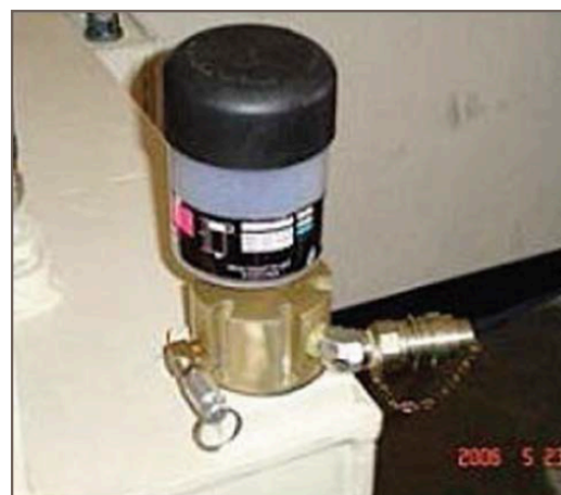
Figure 1. BSF kit installed on a hydraulic oil reservoir

The carts provided fast filtration rates to facilitate quick rotation between the 63 hydraulic systems. Conco personnel moved carts every four hours to ensure that each oil reservoir was filtered according to a specific rotation schedule. Deviations from the rotation schedule were made in the event of excessive particle count results in order to immediately target the contaminated hydraulic system. Detailed weekly logs were provided to the customer.