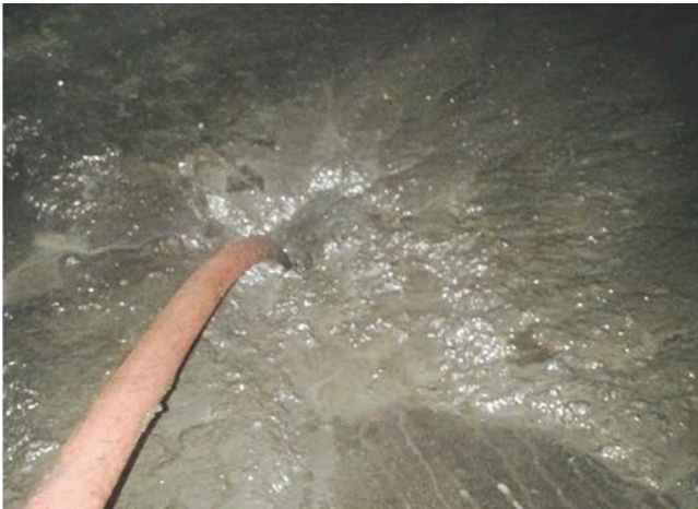
Figure 2. Oil reservoir prior to annual cleaning

The final component of the ISO cleanliness program was annual cleanings of each hydraulic reservoir. To ensure that each system was free of any dirt and debris Conco would clean each system’s reservoir every year. During a shutdown period, Conco's confined space certified personnel would drain and clean the reservoir, inspect/replace suction strainer, replace all filters, and inspect/replace reservoir access gasket. By cleaning the reservoirs every year, we were able to ensure that none of the build up on the bottom and walls of the tank were transferred into the hydraulic system.